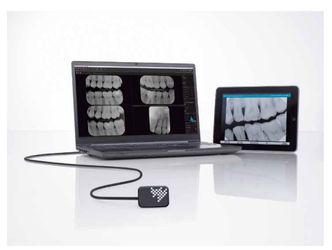
VistaRay sensor technology