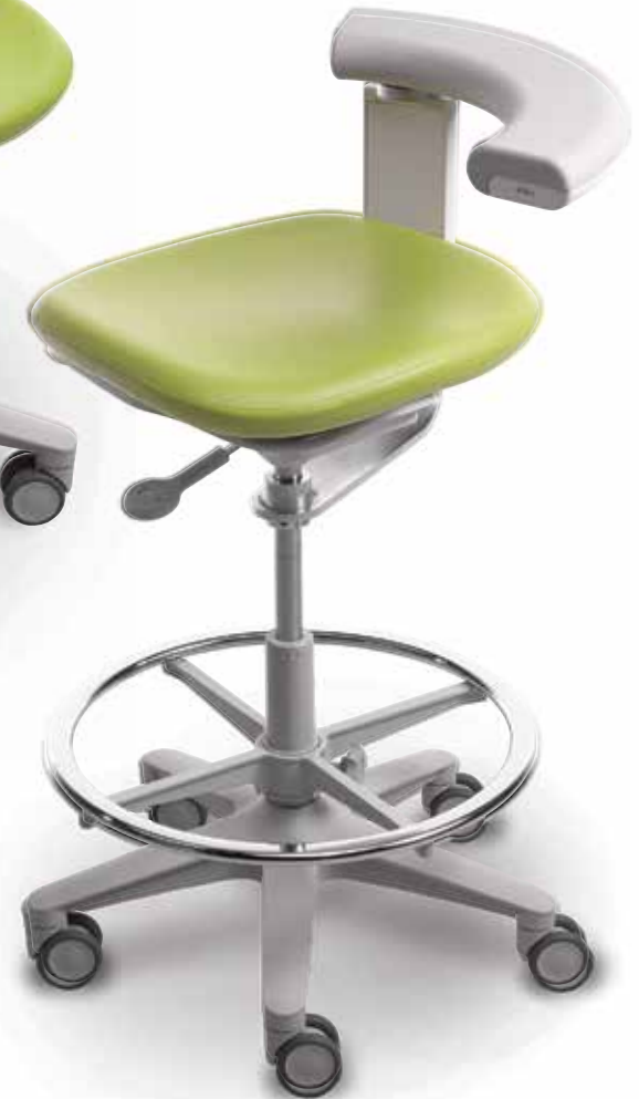
A-dec 522 Assistant's Stool