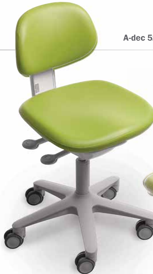
A-dec 521 Doctor's Stool

A push button makes access and one handed adjustments easy.