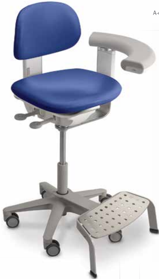
A-dec 521 Doctor's Stool with Optional Swing-out Armrests